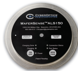
Above: WaferSense ALS300 Above Right: ALS200 (anodized) Right: ALS150

WaferSense™ ALS moves through your semiconductor process equipment to take critical level measurements. Wafer-like, it is compatible with your existing automation, while its wireless communication provides real-time, accurate data to speed your tool setup and maintenance. This data can also be logged, so you can define your equipment's optimal setup.