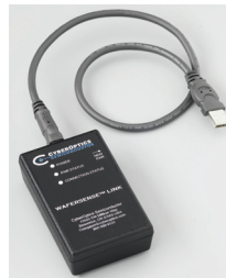
Right: WaferSense link is a compact (92mm x 58mm x 28mm) USB 1.1 compliant device enabling wireless communications with the sensor via Bluetooth®.