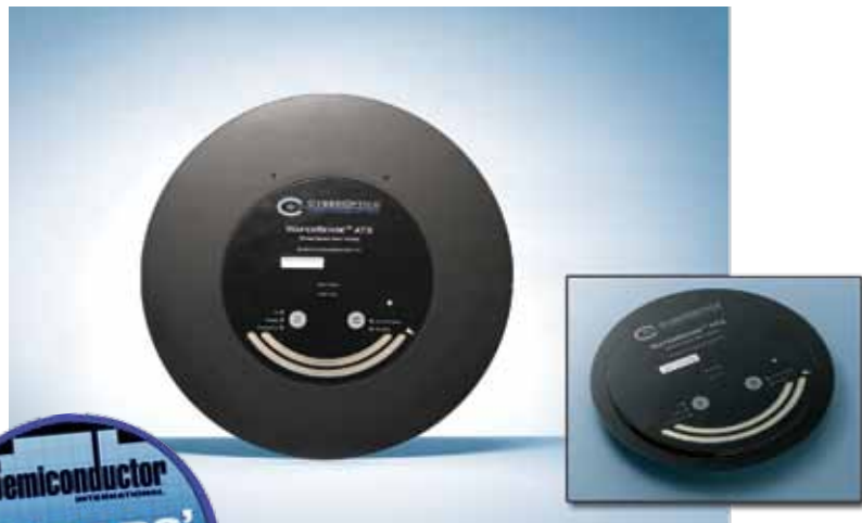
Above: WaferSense ATS300C Inset: ATS200C